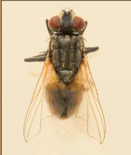
MUSCA DOMESTICA AKA THE HOUSE FLY