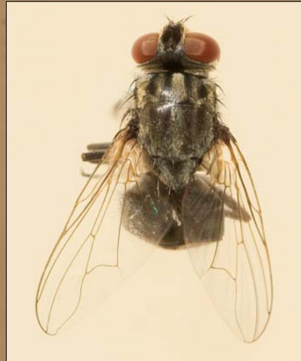
STOMOXYS CALCITRANS AKA THE STABLE FLY