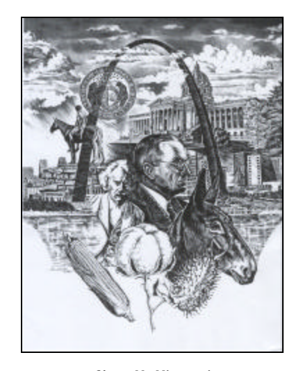
Show-Me Missouri Unframed size— 20 in W x 25.5 in L

Available framed and matted or unframed, these artist-signed and numbered works of art will be an attractive addition to a home or office. Plus, you help build a strong future for Missouri families and our local communities. The proceeds benefit the Missouri's Cattlemen Foundation's scholarship program, farm safety / youth education efforts and a matching grant program for physically challenged youth.