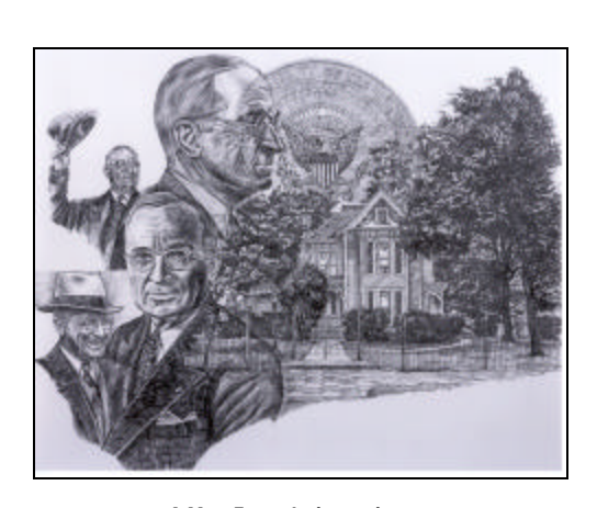
A Man From Independence Unframed size— 23 in W x 19 in L